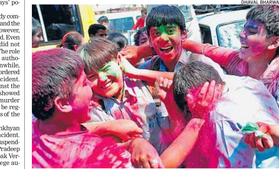
RANG BARSE: Students of a school in Ghodasar herald the city's Holi break